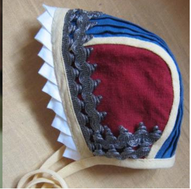
Lysts version in red linen, blue linen in pleats and poor man's lace at front edge. The order included a silver lace.