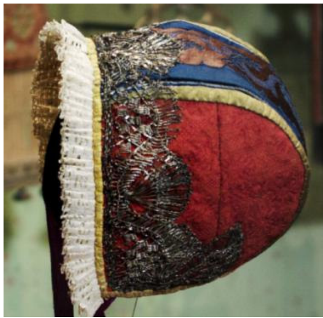
The origin, a christening bonnet from Nås, Dalarna. It is made of red wool, blue patterned silk and a lace at front edge. A lace of silver adds a final elegance.

Lyst often take inspiration from the treasure of the folk art. It contains carful handicrafted and lovely designs. To have this as an outgoing point is a joy, and it was stimulated from a customer who wanted to have a christening bonnet of beauty and traditional connection