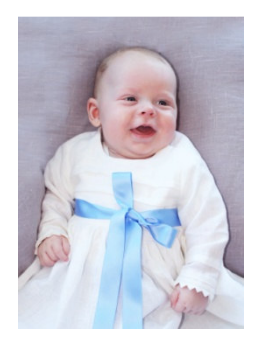
Dear little Lukas in size 68 cl, 15 weeks old, 67 cm tall and about 8 kg.

These are the ideal body measures in each size, measured tight at body. At dress extra width is added for comfort.